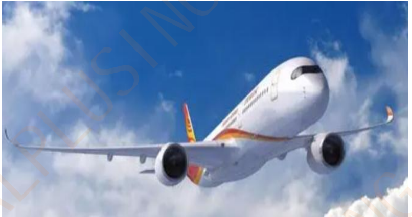
Air transport (No magnet/Lithium free battery)